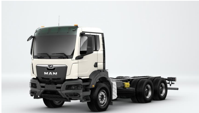
Illustration can deviate