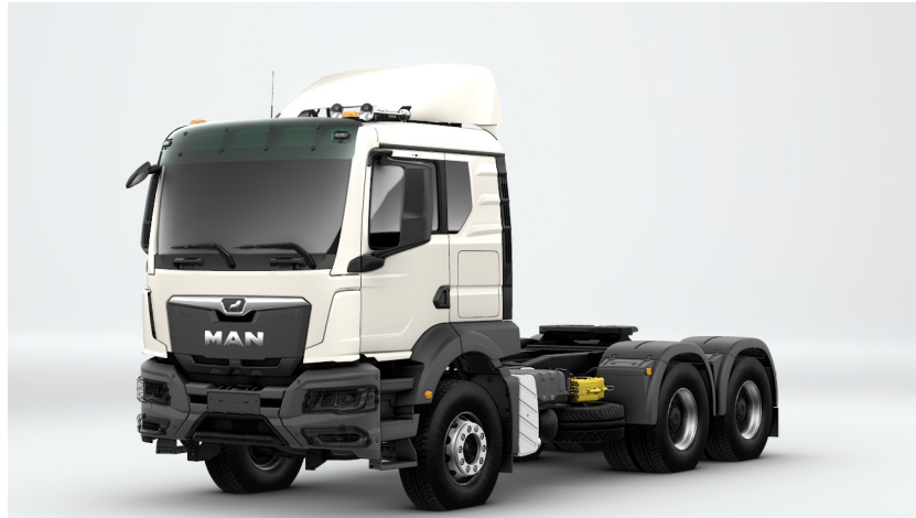
Illustration can deviate