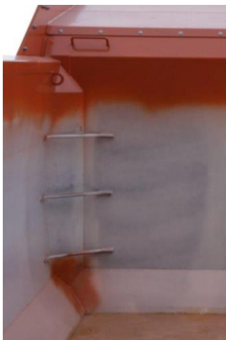
High position of hinges (more space for unloading)