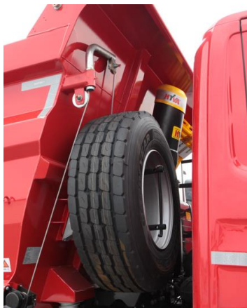
Straight front wall with LONG COVER H cylinder