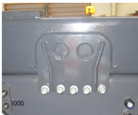
Protective grills for rear lights