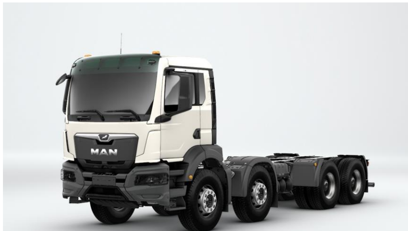
Illustration can deviate