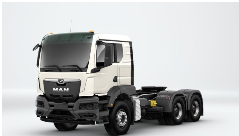
Illustration can deviate