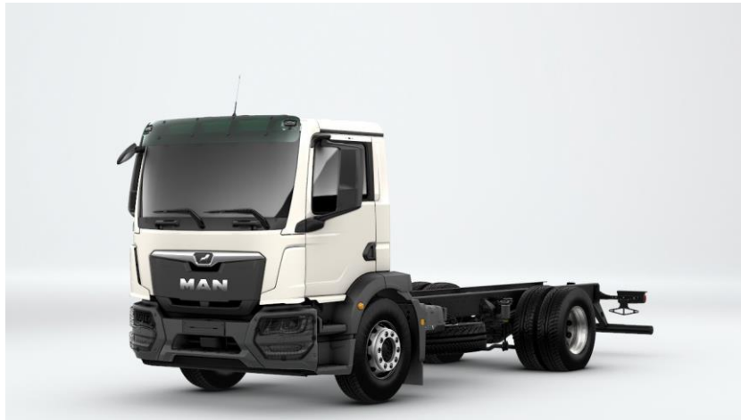
Illustration can deviate